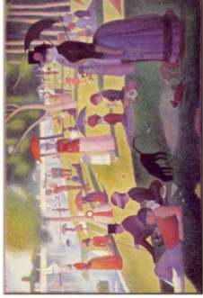
A Sunday Afternoon on the Island of La Grande Jatte, 1884-1886 By: Georges Seurat